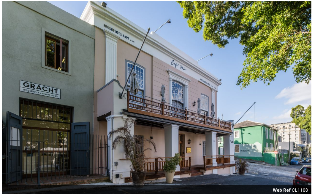
Web Ref CL1108

Shop 8 Central Parade Cnr Victoria and Camps Bay Drive Camps Bay 8005